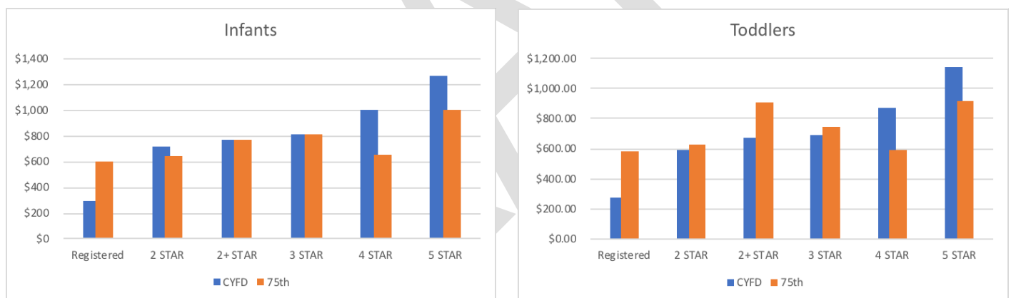
FIGURES 2a and 2b. CYFD Reimbursement Rates Relative to 75 th Percentile Market Rates for Infant and Toddler Care by STAR level

Figures 2a and 2b compare CYFD rates and 75 th percentile market rates for infant and toddler slots by STAR level. CYFD reimbursement rates increase with star level for all age groups. For infants (Figure 2a) CYFD rates are below the 75 th percentile for registered homes, the least regulated type of care, equal to the 75 th percentile rate for 2+ and 3 STAR care, and well above the 75 th percentile for high quality 4 and 5 STAR care. A similar pattern is evident for toddler care (Figure 2b).